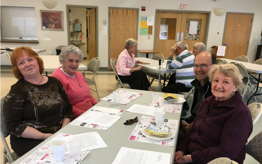
Neighborhood Network hosted a lunch at the Wells-Ogunquit Center at Moody on May 10.