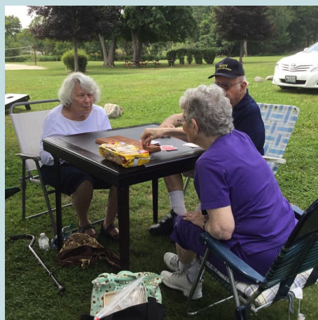
Highlights from Our Annual Picnic at Newcastle Common